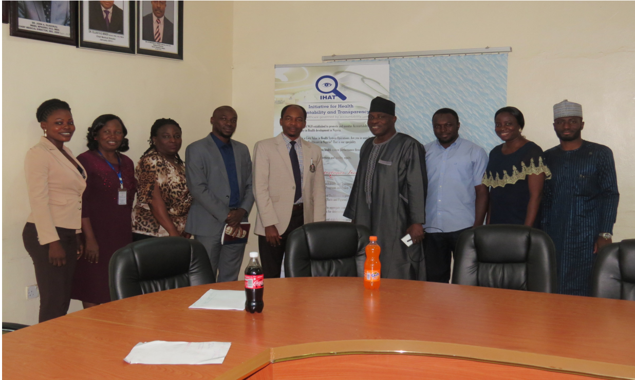
Partnership Meeting with Garki Hospital