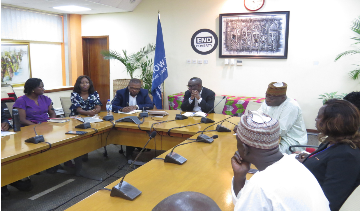
IHAT Exploratory Meeting With the World Bank Group